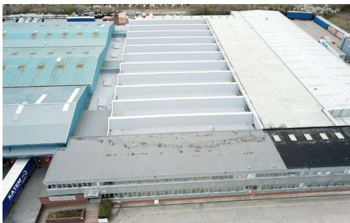
New roof covering on Unit 2 (2025).

Unit 1 is available from January 2026. Unit 2 is immediately available on flexible terms and can be combined with Unit 1 to suit larger requirements.