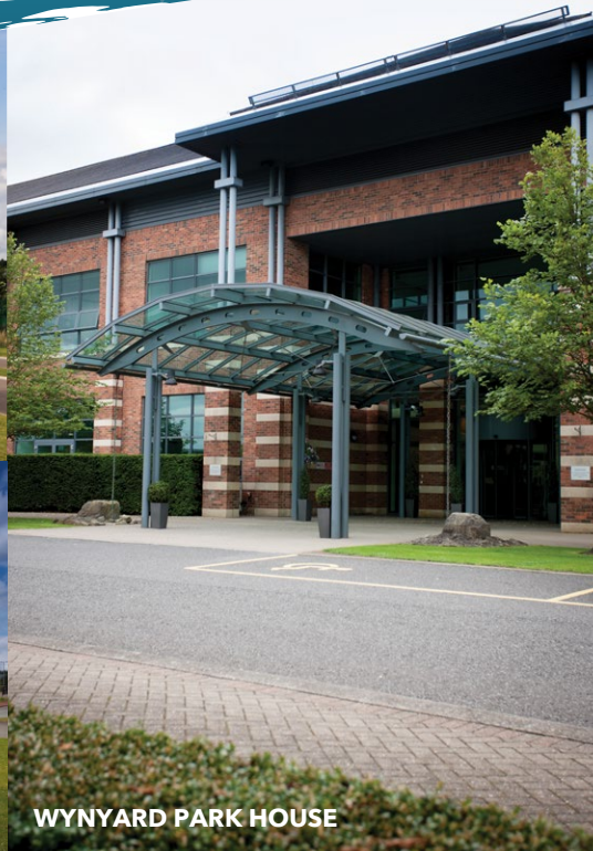
WYNYARD PARK HOUSE