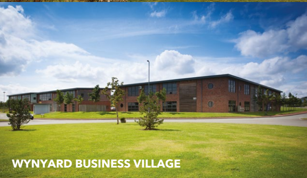
WYNYARD BUSINESS VILLAGE