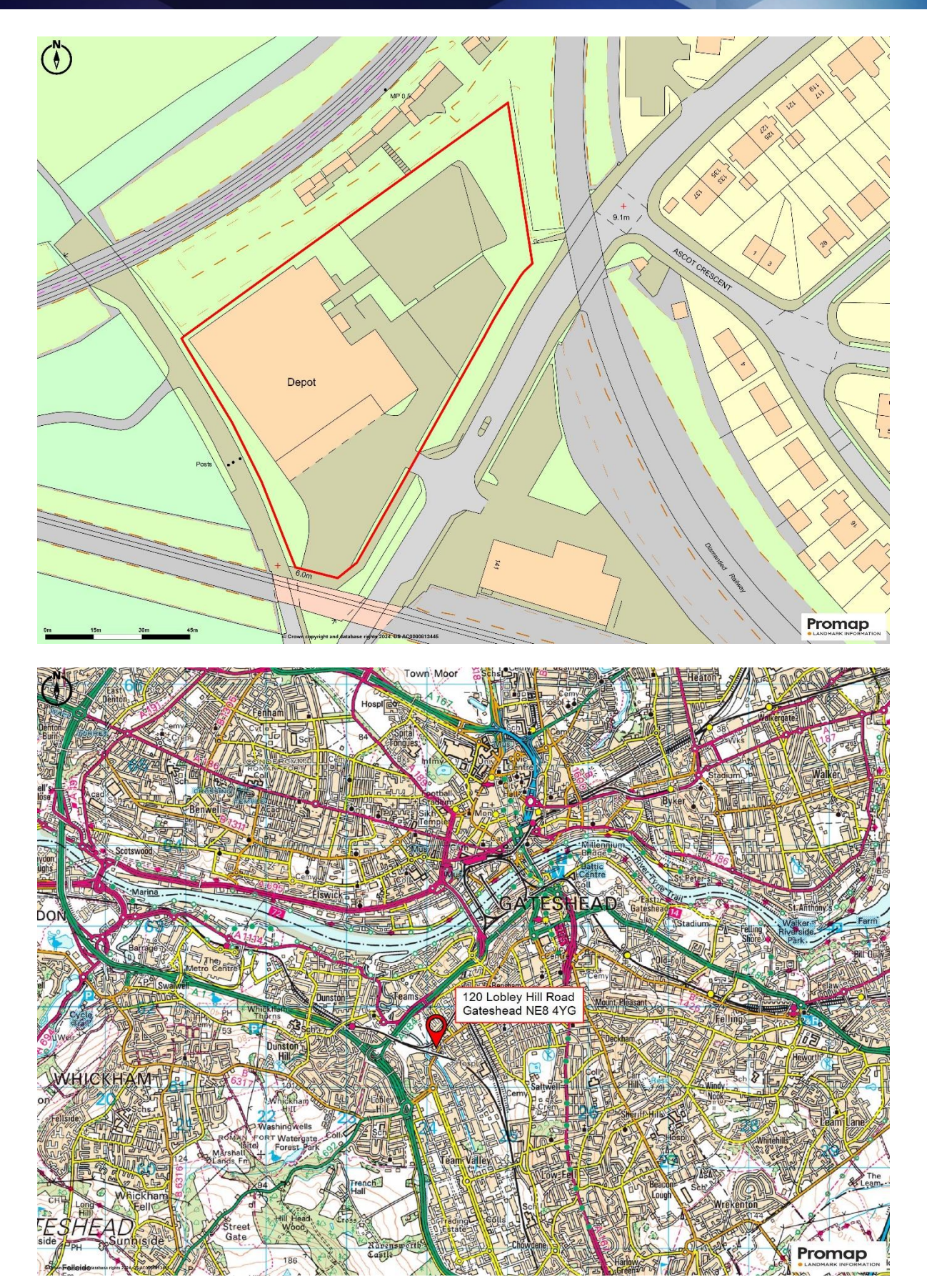
HTA Real Estate Ltd conditions under which particulars are issued HTA Real Estate Ltd and for the vendors or lessors of this property whose agents they are, give notice that: (i) The particulars are set out as a general outline only for the guidance of intending purchasers or lessees and do not constitute, nor constitute part of, an offer or contract. (ii) All descriptions, dimensions, references to condition and necessary permissions for use and occurse of each of them. (iii) No person in them as statements or representations of fact but satisfy themselves by inspection or otherwise as to the correct but correctness of each of them. (iii) No person in the employment of HTA Real Estate Ltd has authority to make or give any representation or warranty whatever in relation to this property. (iv) All rentals and prices are quoted exclusive of VAT unless otherwise stated. June 2023